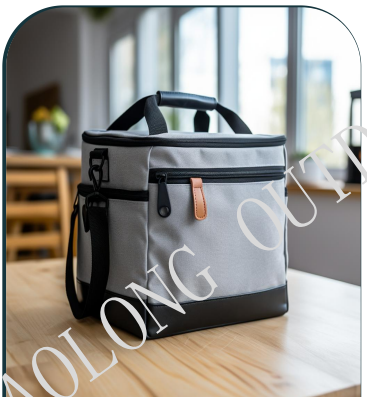
G2022 Capacity: 10L to 30L Material: 500D PVC Tarpaulin

Features: Your Essential Companion for Fresh Food and Beverage Storage on Every Adventure. Color: Black/Blue/Grey/Green/Mint