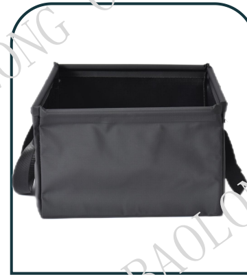
98012 Capacity: 10L/15L/20L Material: PVC Tarpaulin