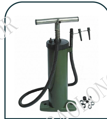
Hand Pump Capacity: 1500/2000/3000cc Material: Stainless Steel