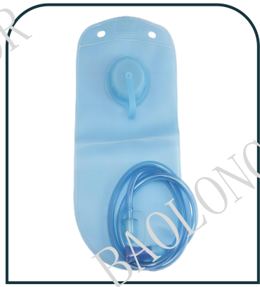
W2012 Capacity: 1.5L Material: PVC/TPU