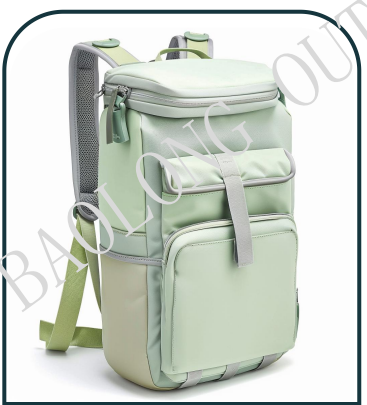
K2022 Capacity: 10L to 20L Material: 500D PVC Tarpaulin