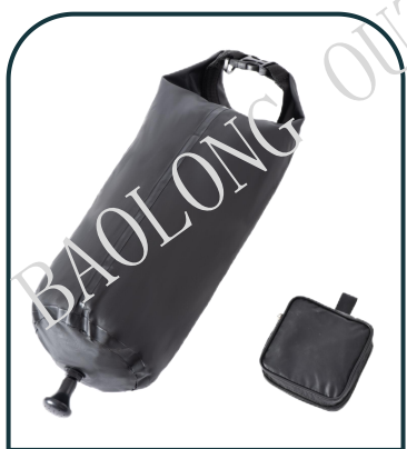
S3015 Capacity: 10L Material: PVC