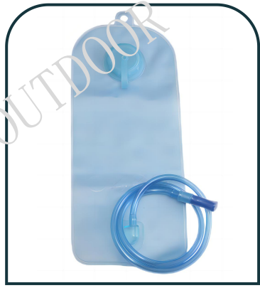
W2017 Capacity: 2L Material: PVC/TPU