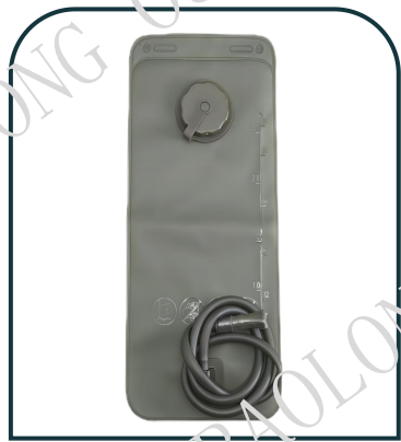
W2018 Capacity: 2L Material: PVC/TPU

Features: The perfect On-the-Go Hydration and Convenience. Color: Black/Grey/Blue