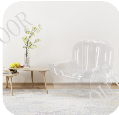
SF01: supporting up to 100kgs/220lbs