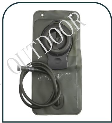
W4017 Capacity: 2L/3L Material: PVC/TPU