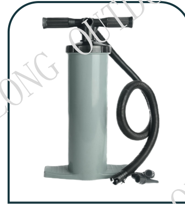
Hand Pump Capacity: 1500/2000/3000cc Material: PP

Hand Pumps: Easy, compact, and adaptable for quick inflation and deflation on the go.