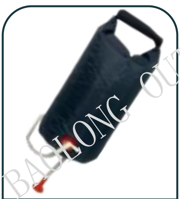
S3016 Capacity: 10L Material: PVC