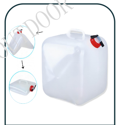
98007 Capacity: 10L/15L/20L Material: PE