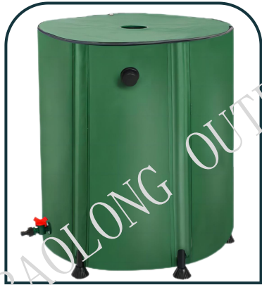
Rain Barrel Capacity: 25L to 1000L Material: UV-resistant 500D PVC tarpaulin

Features: Collect rainwater effortlessly, reduce water bills, and enhance your garden with the pure, natural water it deserves.