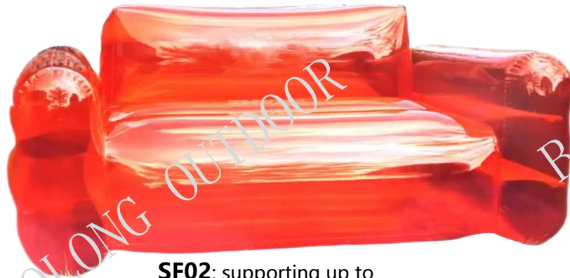
SF02: supporting up to 200kgs/440lbs