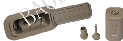
Build-in Electric Pump