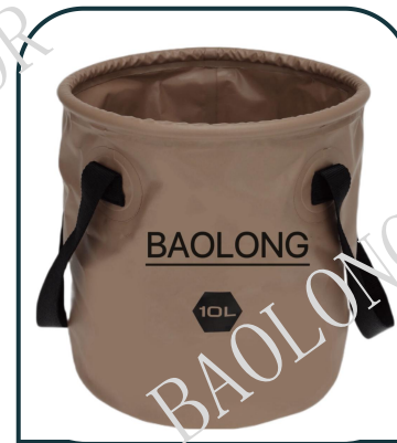
98015 Capacity: 10L/15L/20L Material: PVC Tarpaulin