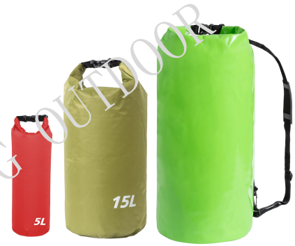
S2012 Capacity: 5L to 50L Material: PVC Tarpaulin/PVC coating polyester