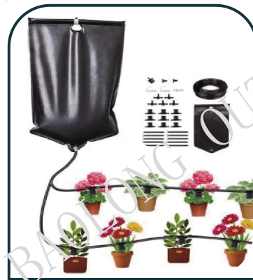
Tree Watering Bag - C1026 Capacity: 10L Material: PVC