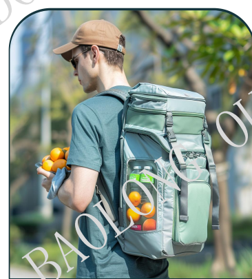
K2023 Capacity: 10L to 20L Material: 500D PVC Tarpaulin