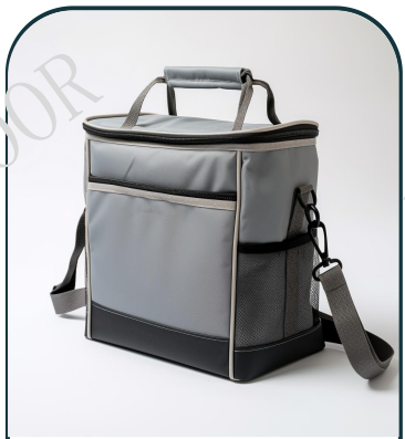
G2023 Capacity: 10L to 30L Material: 500D PVC Tarpaulin