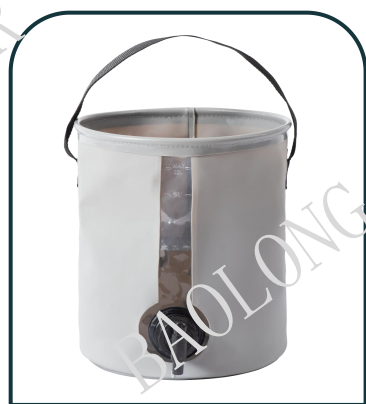
98015 Capacity: 10L Material: EVA