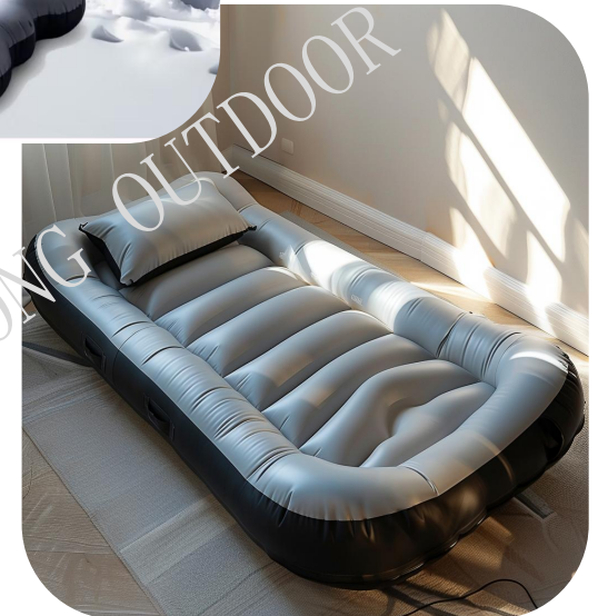
CB01: supporting up to 100kgs/220lbs