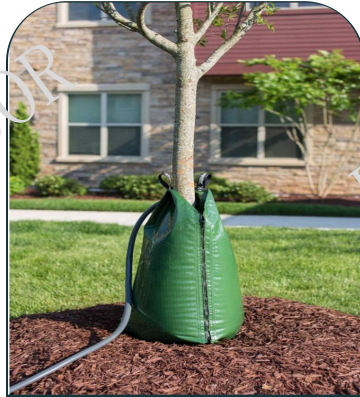
Tree Watering Bag - C1025 Capacity: 75L Material: PVC/PVC Tarpaulin